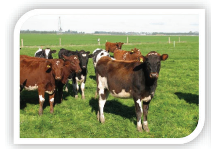
Mid Canterbury herd showing an average weight of 270kgs at 200 days (2013) - Atkinson Ltd

1-2Kg /calf /day, to be fed in conjunction with ad-lib hay or straw and good guality pasture.