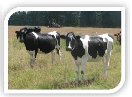
Same Mid Canterbury herd showing an average weight of 623kgs at 22months (2014) - Atkinson Ltd